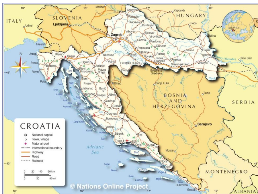
Map 1: Contextual map of Croatia

2. Croatia unilaterally declared its independence from the former Yugoslavia in 1991. This led to the four-year Croatian War of Independence. The war effectively ended in August 1995, with Croatia re-asserting its authority over almost the entire territory. Eastern Slavonia was later also reverted to its rule in January 1998, following a peaceful transition under UN-administration.